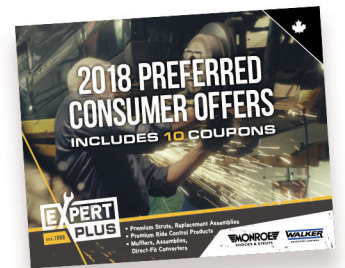
MONROE® / WALKER® COUPON BOOK 10 Valuable Coupons