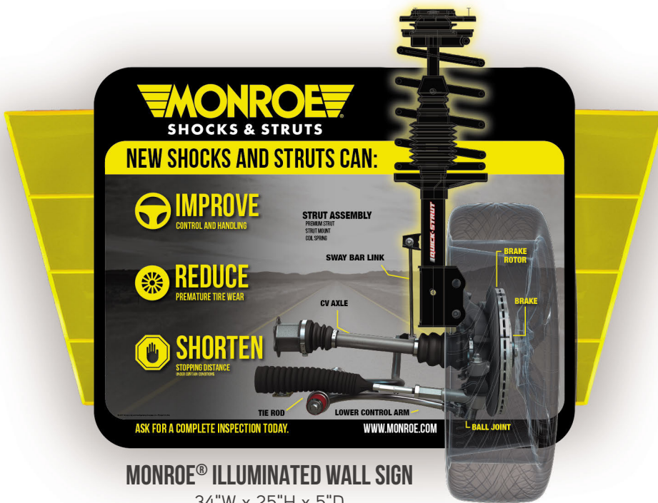
MONROE® ILLUMINATED WALL SIGN 34"W x 25"H x 5"D