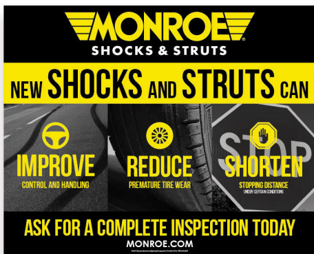
MONROE® FLOOR GRAPHIC 2.5"W x 2'H