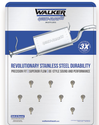
WALKER® KEYCHAIN HOLDER 12.75"W x 17.5"H