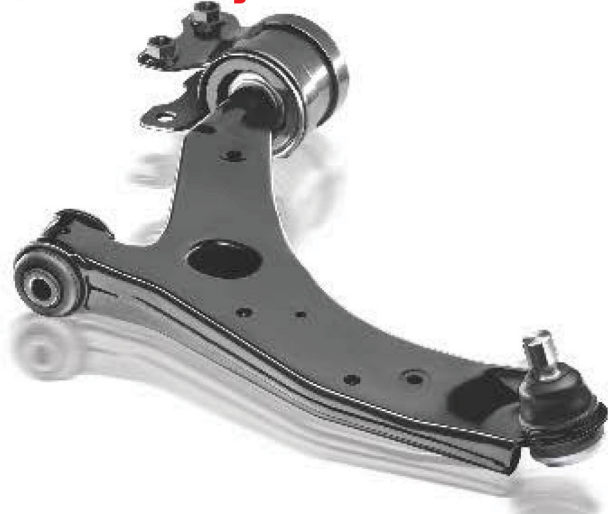
Lower Ball Joints