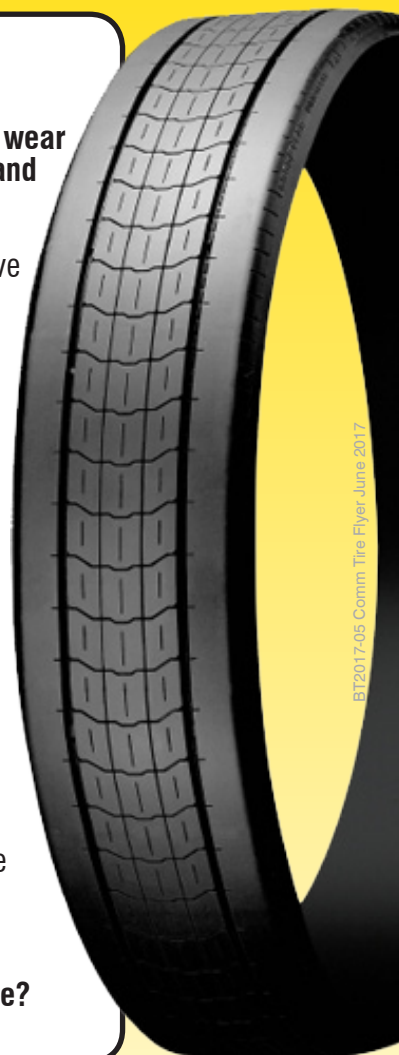
BT2017-05 Comm Tire Flyer June 2017

Benson Tire has 2 retreading plants in Ontario...one in Cornwall and one in London. Want to see how it's done? Contact one of our locations to book a plant tour.